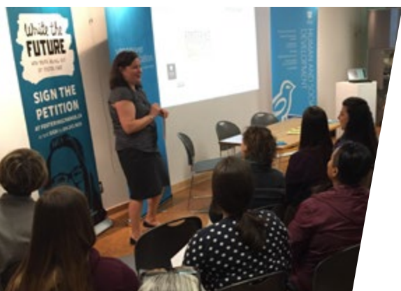
Vancouver Foundation news conference for Fostering Success announcement